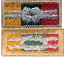
William D. Boyce New Unit Organizer Award